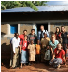
eMi team with widow & family

"Pure & undefiled religion... is this: to visit orphans and widows in their trouble" James 1:27