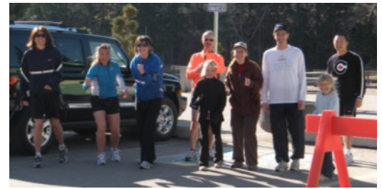
TEAM EMI at a pre-race Fun Run in Bowness Park

Scripture commands us as Christians to take care of orphans and widows. eMi's mandate to "design a world of hope" for the poorest of the poor echoes this command. By designing a training centre, health clinic and transitional orphanage for Sister Connection, we are building the capacity of this ministry to reach out to orphans and widows in their trouble.