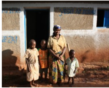
Widow supported by Sister Connection

In Burundi, Sister Connection is helping widows move from extreme poverty and unmentionable trauma to a hope in their future. In a society that dishonours women who have no husband, their plight has been identified and they are now being provided housing, vocational training, and grief and trauma counselling. Based on the number of widowed women in this country, this is no small task.