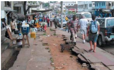
The infrastructure of downtown Monrovia has been devastated.

Liberia is a nation that has suffered over 15 years of brutal and destructive civil war. Physically, the nation's infrastructure has been destroyed. There is no electrical power throughout the country - all the wiring has been stripped from the power poles and sold, and no potable water system exists in the capital of Monrovia, a city with a population of over 1.5 million people. Small, portable generators abound and water is sold in 5 gallon containers and trucked into the city from outside sources. Major buildings have suffered severe damage - the national university has a library with no books and science labs with no equipment! Students are taught but have only their notes to study from as there are no other resources available. In addition, the social fabric of the country is reeling from the emotional and physical abuse suffered because of the conflict.