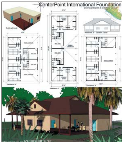
Typical building module design.

Each building in the village is based on a prototype building unit . This typical module can be doubled, flipped, or mirrored in order to create dorms and classrooms of various sizes, as well as a preliminary library building. The base price for this typical unit is approximately $35,000 USD and will allow CenterPoint to get started on a small scale and build out the Master Plan in manageable stages.