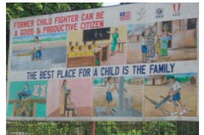
Much healing is needed in Liberia, as attested to by this billboard in Monrovia.

Where does a devastated country like Liberia start to rebuild? The motto of the ministry our eMi team went to serve, CenterPoint International , is "Giving People a Place to Grow." They have a vision to create a "Center of Reconciliation" that will be a place to renew the physical and spiritual well-being of all Liberians. To accomplish this, they plan to develop a retreat center that will offer counseling and educational training, as well as a variety of other programs. Their goal is to help empower local leaders, former combatants, children of war, battered women, and bewildered students by uniting with the local church to bring about true reconciliation.