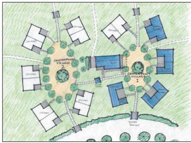
Sketch showing the village concept layout.