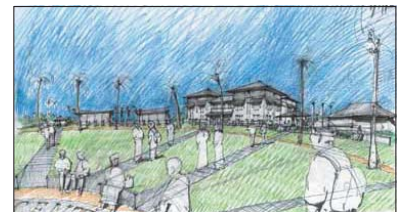
Sketch of the central campus.